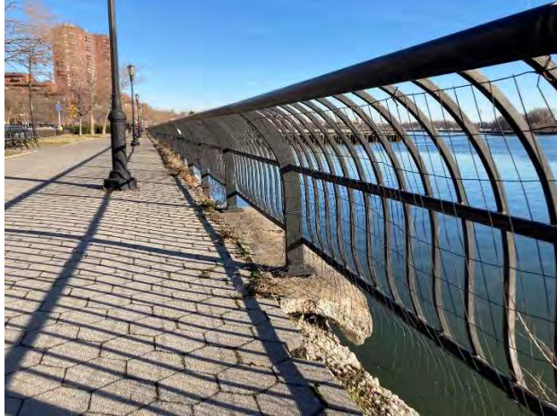
Photo 3: Typical Railing near 105 th Street looking north. Concrete is deteriorating under the rails. Balusters in background are not attached to anything as the concrete is missing