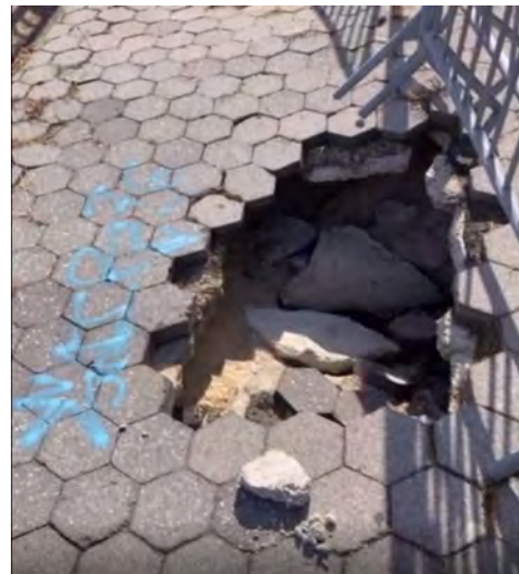
Close up of the same sink hole. See "A" on the keymap, page 3.

Above: Hexagonal pavers and concrete topping have collapsed into a cavity formed by tidal action and water seeping underneath the structure . This happens frequently along the esplanade. Temporary barriers are installed for safety here.