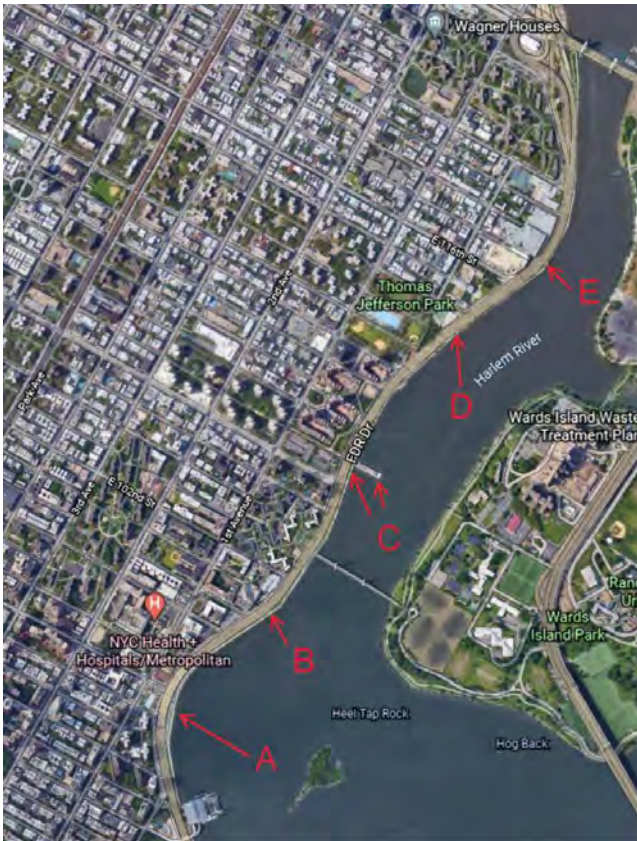
Keymap showing 91 st – 125 th Street.