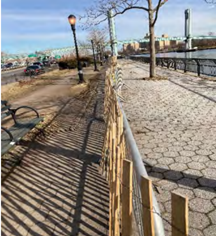
Fencing around multiple sinkholes often leaves only a narrow strip of bare earth between fencing and the FDR