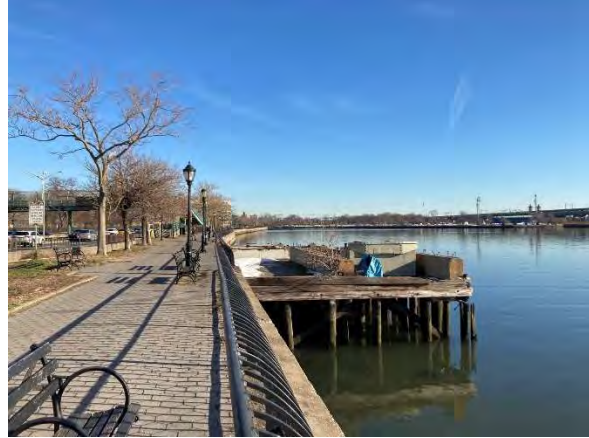
Photo 5: The smaller pier at 110 th street is deteriorated and closed to public. It could be destination for fishing or sitting, away from FDR.