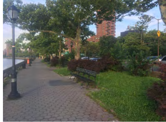
For comparison and to show potential: Around 112 th street across from Thomas Jefferson Park, this brief section has better planting and not yet any collapsing sink holes. In addition to repairs needed elsewhere, preventative structural work will be needed to preserve the remaining places like this.