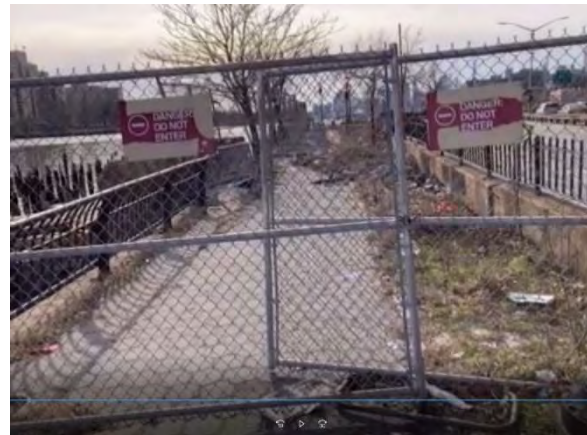
Above: Fencing at 117 th street, looking south.