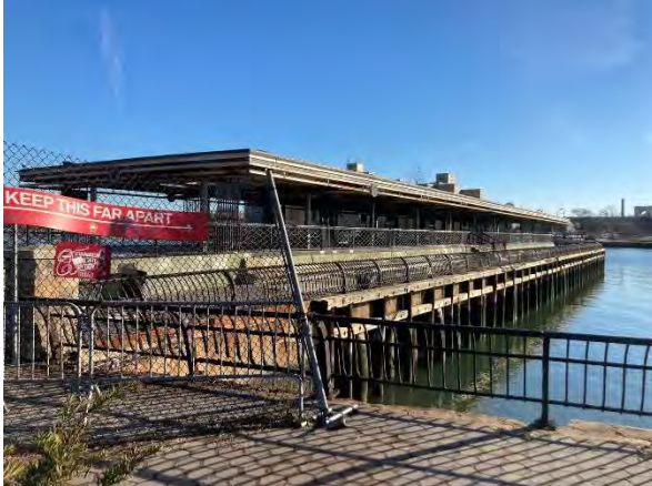
Photo 4: Pier at 107 th Street: See "C" on Keymap Potentially at major destination, it has deteriorated and been deemed unsafe and closed.