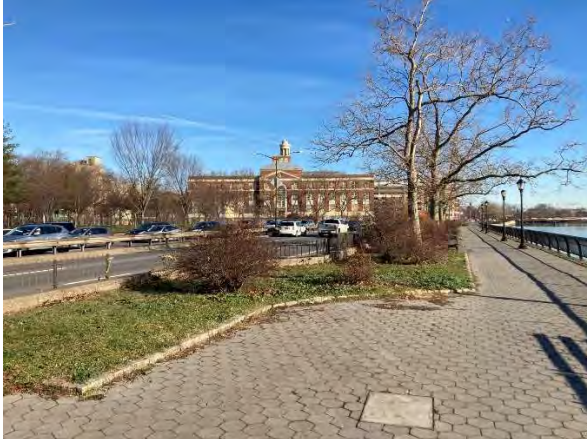
Photo 6: The remaining areas have minimal planting to obscure noises of nearby cars.