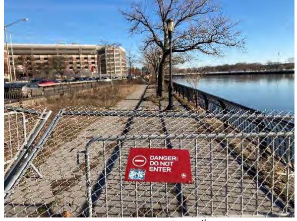
Photo 7: Esplanade north of 114 th street has all been closed for safety concerns from structure. See "D" on Keymap, page .