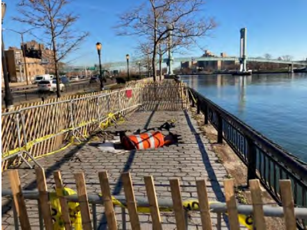
Photo 2 Looking north from 98 th St. Another sinkhole from tidal action. The FDR drive can be seen to left, adjacent to eroding structure.